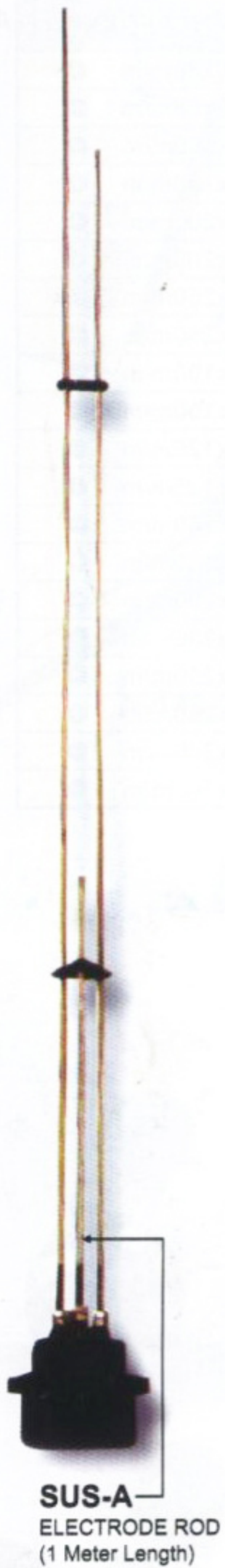
SUS-A ELECTRODE ROD (1 Meter Length)