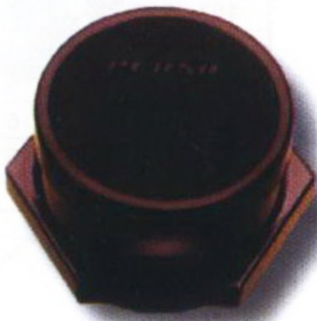
PS-3S ELECTRODE HOLDER