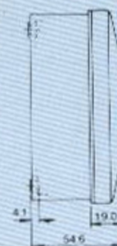
PS0, PS1 系列 Series PS0, PS1